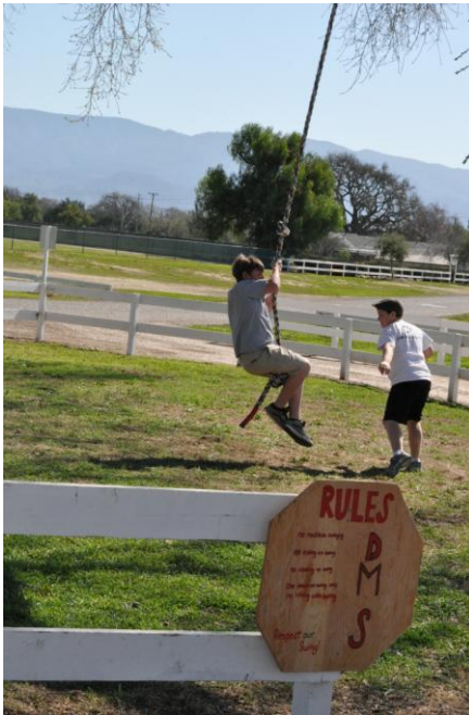
Above: The new rope swing is up! Thank you, Leadership class.