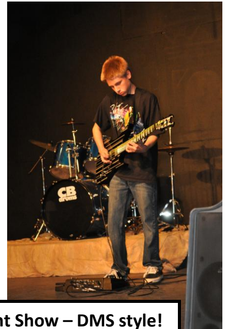
Talent Show – DMS style!