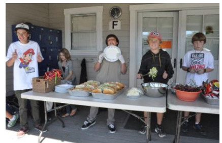
Up and Right: SYV firefighters demonstrate an aquatic helicopter crash simulation training exercise. Straight Right: service with a smile!