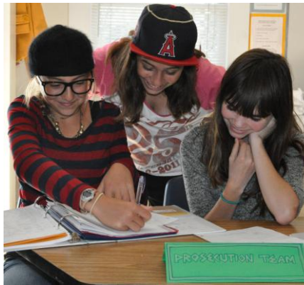
Above and below: the "Trial of Julius Ceasar" in progress during 7 th grade Social Studies class.