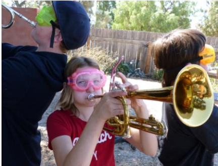
Above: Safety goggles necessary in band today as students mix music and science in an interesting experiment.